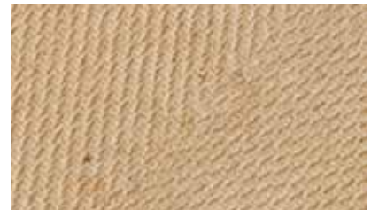
The unique surface finish of STEICO top

In addition, STEICO top insulating boards are diffusion 'open'. Should moisture penetrate the board, it can easily evaporate, without damage to the board.